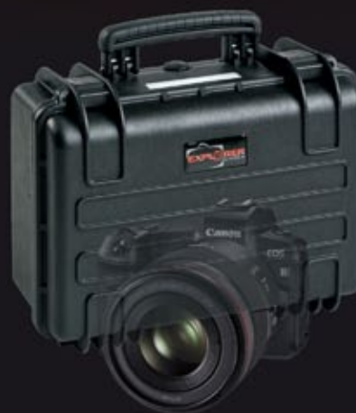
CANON EOS R