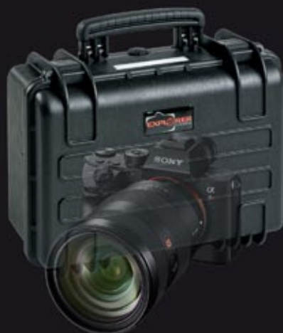
SONY A7R III