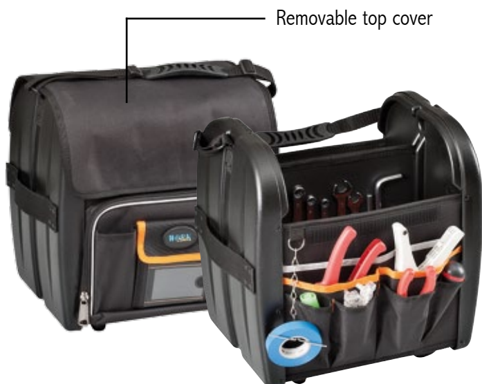
Removable top cover