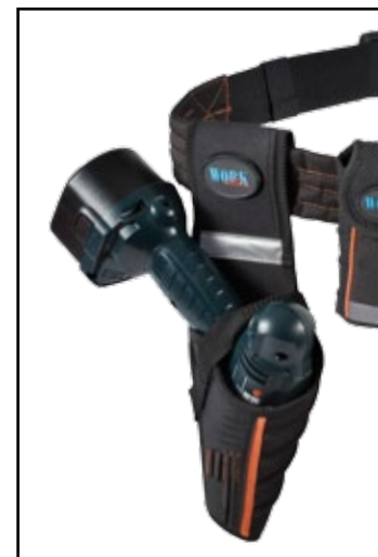
TOP BELT N with TOP DRILL