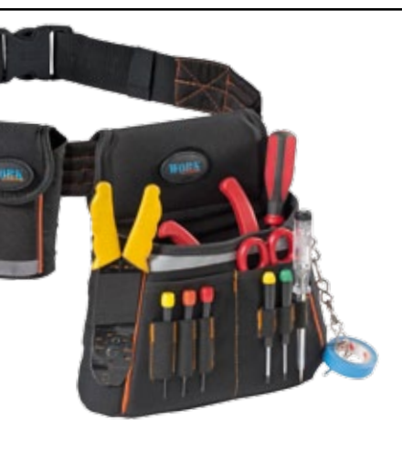
N, TOP PHONE N and TOP ELECTRA N