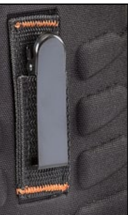
up to fasten the items to